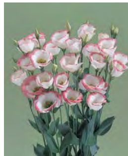
II Pink Picotee FRS652