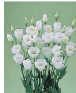
II White FRS660