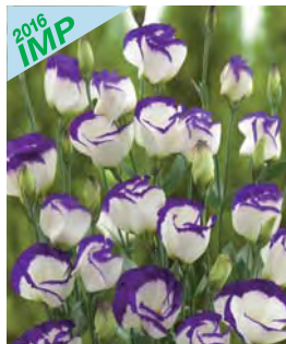
II Blue Picotee FRS664

The above data is based on trials completed in Japan. Actual results are dependent upon environmental conditions and local practices that may affect variety characteristics and performance.