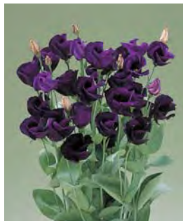
II Deep Violet FRS661