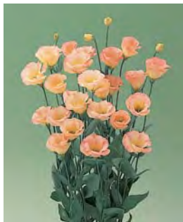
II Champagne FRS706